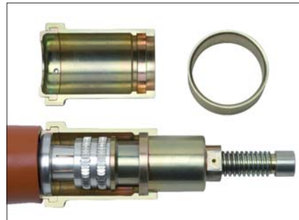
Parts to be used for compression of contact elements