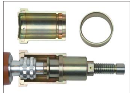
Parts to be used for removal of the contact elements